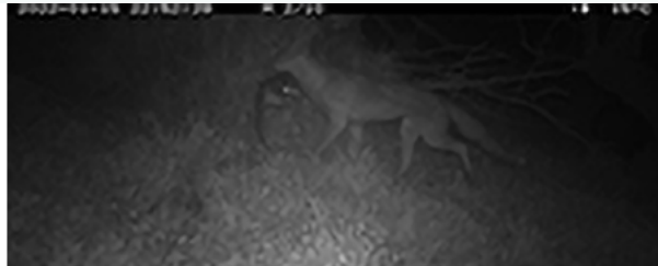
Fox with captured Ringtail Possum photographed recently in the south east corner of The Cape.