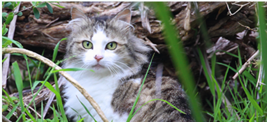
Wandering cat photographed in the south east corner of The Cape.

Thanks to the use of cameras, we now have documented evidence of foxes emerging from the coastal reserve and roaming through the estate during the evening with captured prey.